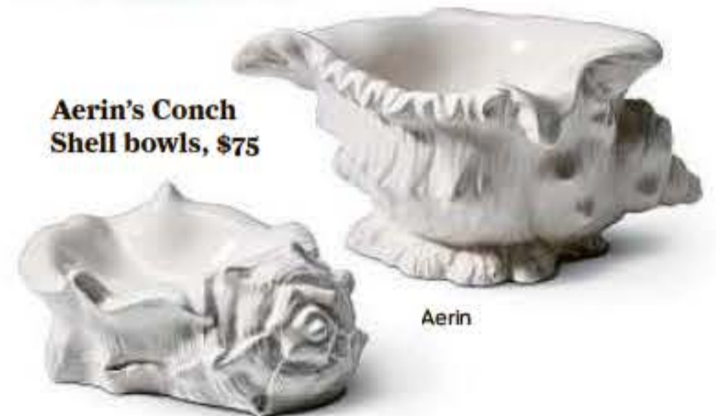
Aerin's Conch Shell bowls, $75