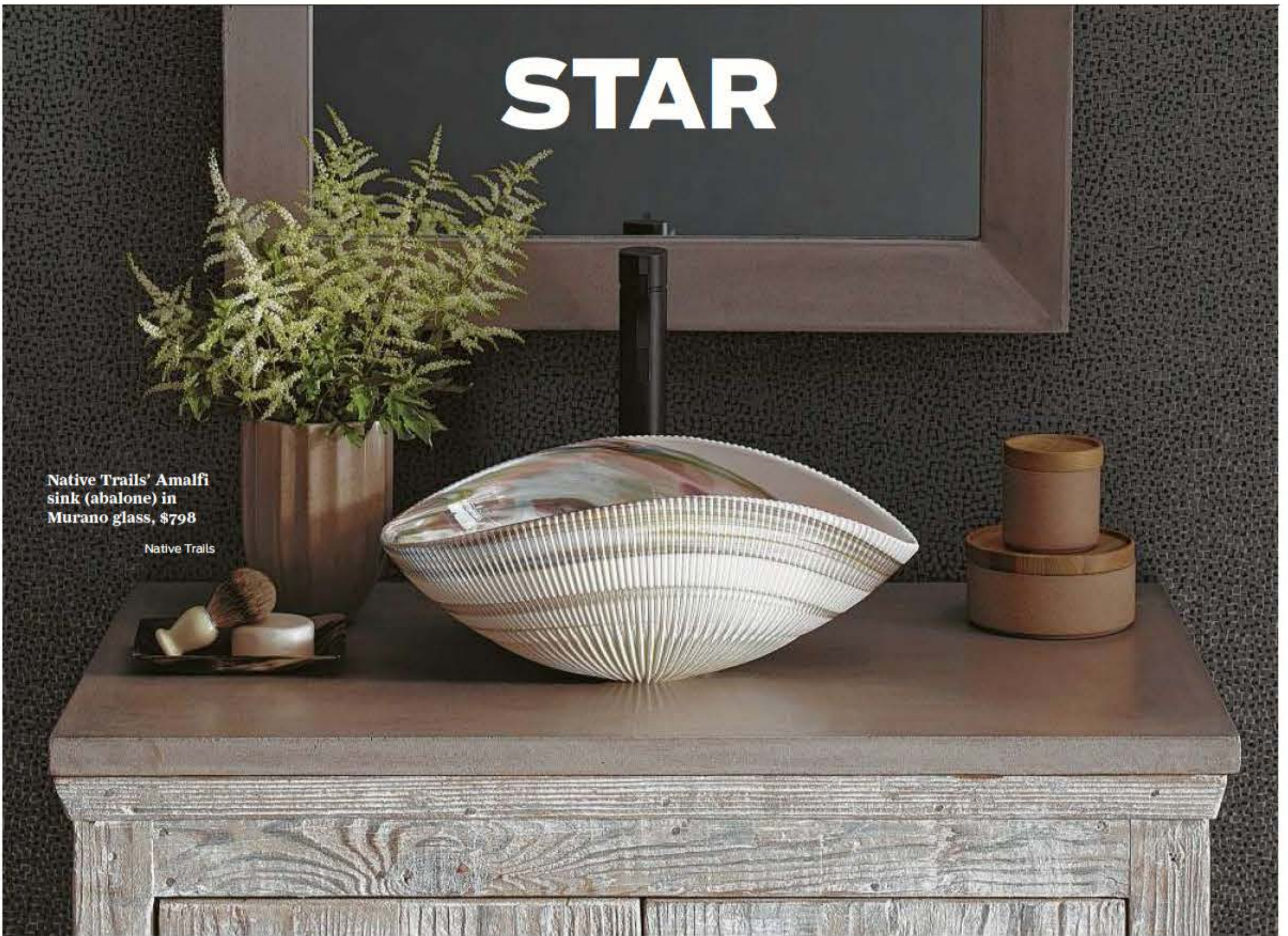
Native Trails' Amalfi sink (abalone) in Murano glass, $798