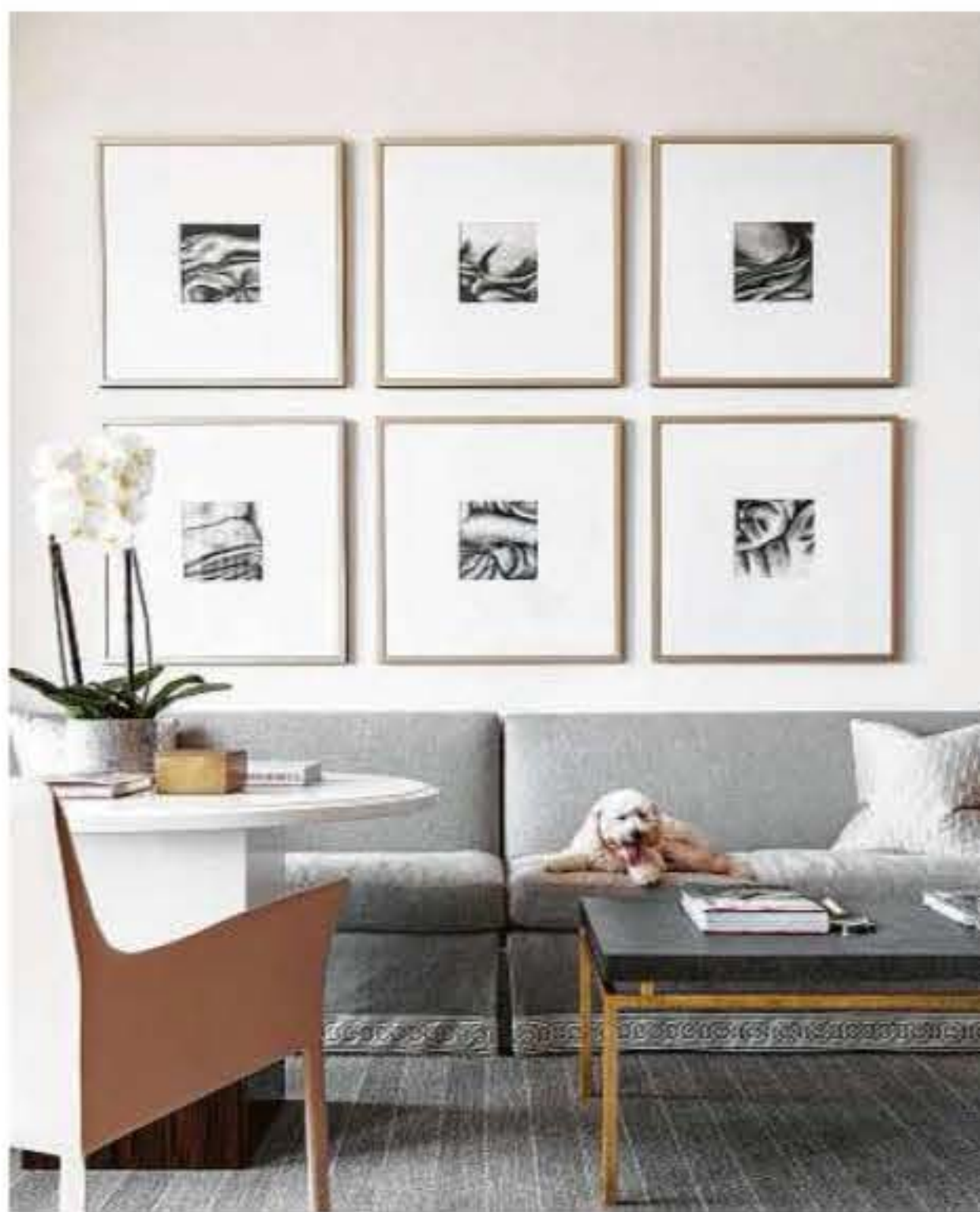
Chandos Interiors designed The Revere’s model unit.

That open space has room for a big dining table and two more intimate seating areas in the living room. One includes a pair of gray velvet sofas in front of a contemporary fireplace, and the other has a long ban-